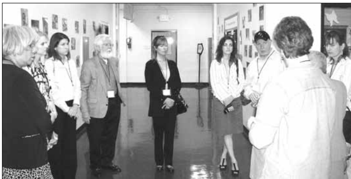
Community leaders learn more about IFM and the International Welcome School during Road Trip

It was a bright, sunny day in May as several community and business leaders gathered in downtown St. Louis to board the Zee Express “party” bus and head out on the first IFM Road Trip. The goal was to visit some of the community sites where the Institute for Family Medicine has established health clinics. The first stop – the St. Louis Public School (SLPS) International Welcome School!