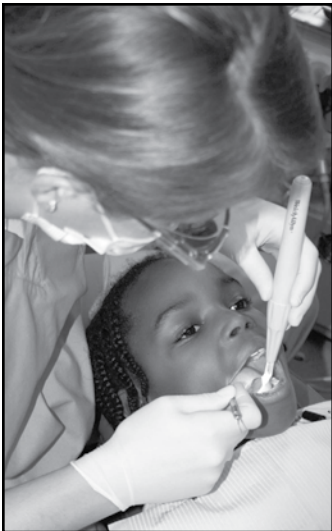
Staff from Reachout America does school based dental exam.

A number of years ago, when the Institute for Family Medicine was just initiating our school health programming, school nurses would tell us, “We love what you do for us. But how can you help us with dental and mental health?” In 2005, the Institute accepted those challenges as part of its strategic plan. The initial effort toward mental health services involved a pilot project taking advantage of some pro bono services from two area mental health providers. It was hoped that the success of this program would lead to funding opportunities to grow that program. Unfortunately, funding for school based mental health services did not materialize, and that program had to be halted.